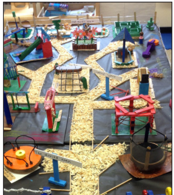
Pre-K's final Playground Project