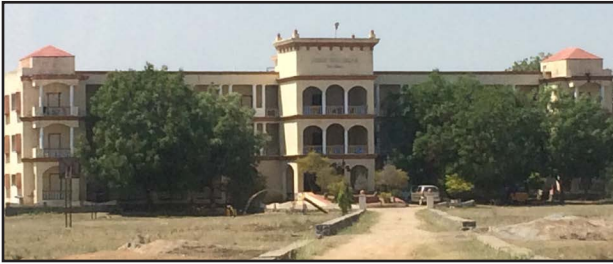
Mission India Bible College - Warangal