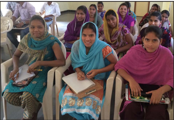
Students at Bible College