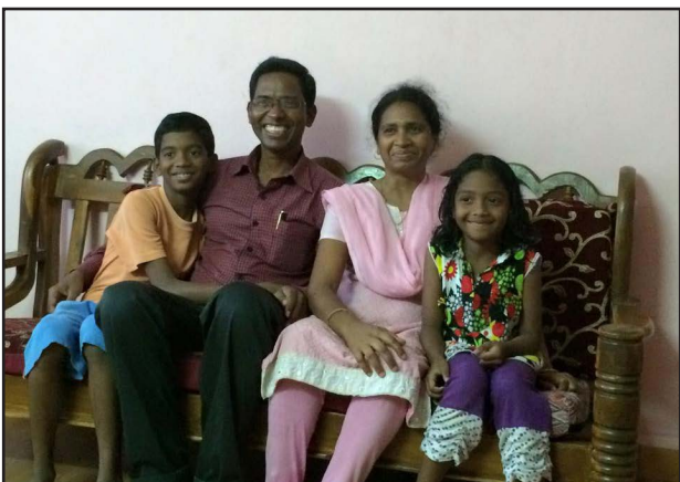
A M.I. Seminary Professor and his family.