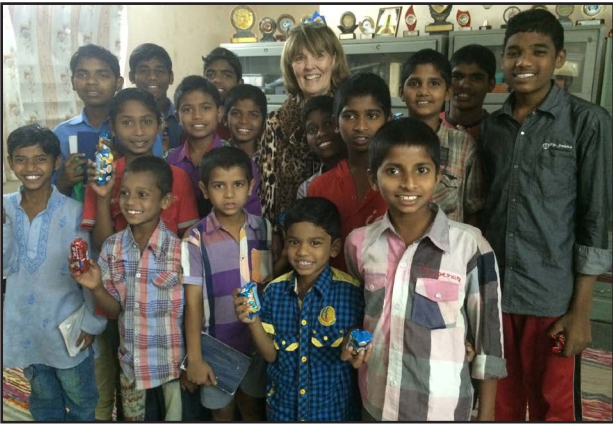
Mercy Home Orphans