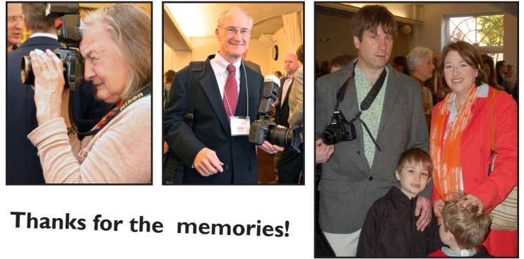
Thanks for the memories!