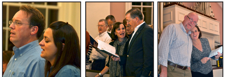
Our pastors got to relax for the evening, and enjoy singing along with the congregation ... in the pews!