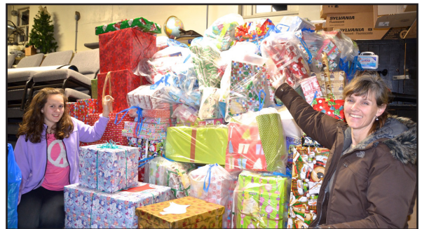
Dove Program Gifts - December 2012