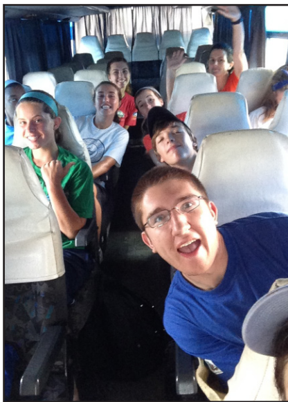
DR Mission Trip