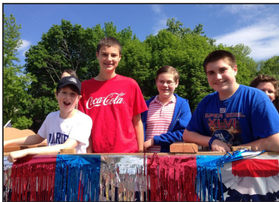
Memorial Day Parade