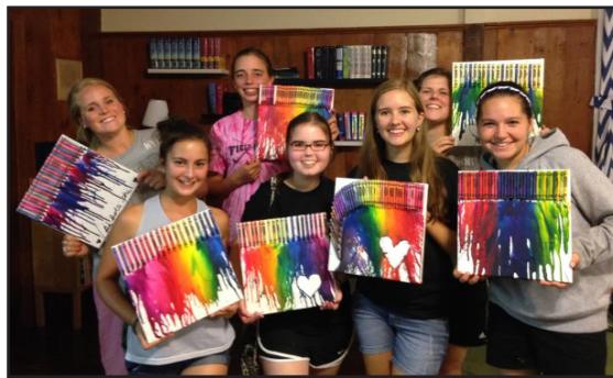
High School Girls' Sleepover