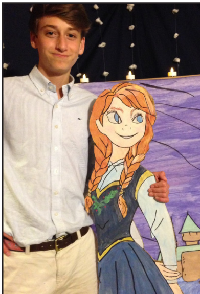
HS Prom After Party