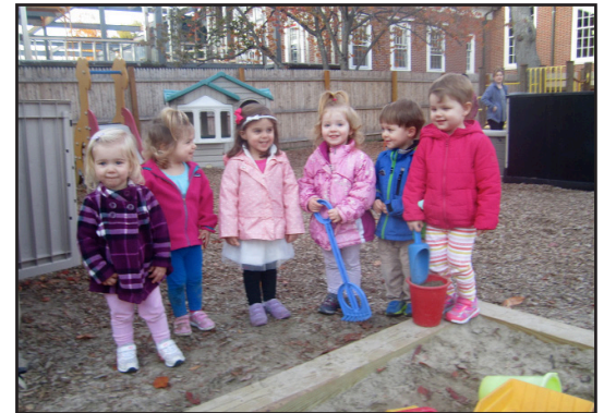
Tot Drop two-year olds pose for the camera.