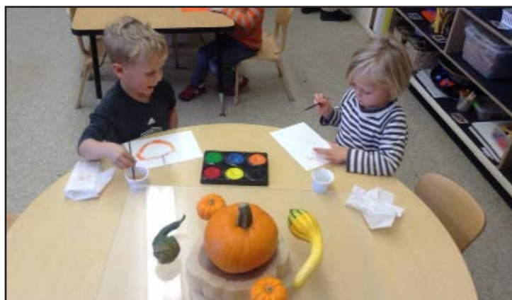
Still Life Paintings in room 10