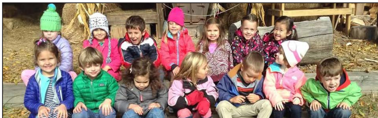
Room 11 Field trip fun