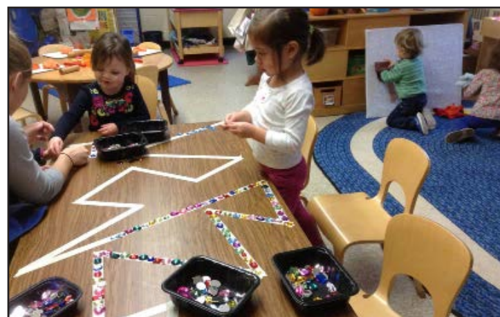
Loose Parts exploration in room 14