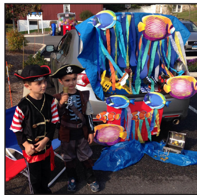
Arrghh- where's your loot matie?!