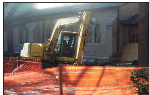
The Great Digger