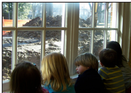
Mountain of Mud