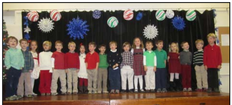
The Pre-K class visits the Senior Center