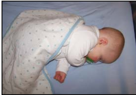
Peacefully napping in the Infant Room

Babies, babies, babies! What a difference a year (or nine months!) makes. 2012 was the year of the Infant at Tot Drop; so many wee ones born in September, October and November and all looking for daycare beginning in January, February and March 2013. Our waiting list is still substantial, with new inquiries added frequently. In contrast, last year we were looking under every cabbage leaf for babies to fill our cribs! The Infant