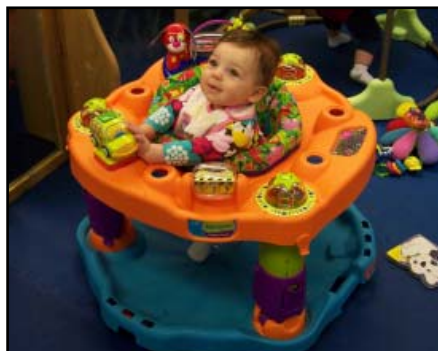
Happy Infant in the Exersaucer

Once an infant can walk independently and with reasonable stability, she or he moves to the “walking ones” side of the room. That’s another busy space! Usually scheduled for seven active explorers, these children are learning new things minute by minute! A large tunnel to crawl through is a favorite adventure; they love building block towers (AND knocking them down!), doing puzzles, manipulating different art materials and enjoying playground time. It is truly incredible that by naptime (from 1:00-3:00) the