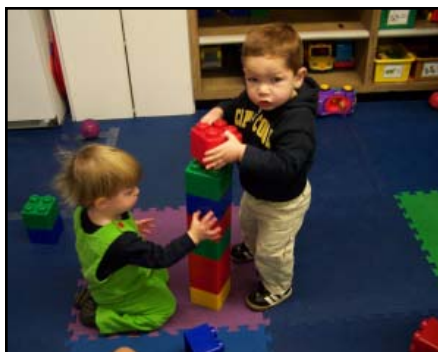
“Walking Ones” build a tower

caregivers can have a quiet, peaceful room with 12-14 children sleeping all at once! (Remember how hard it was for you to get one child to sleep?!)