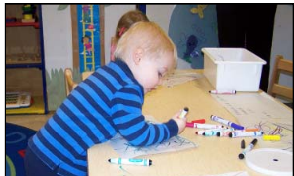
Two year old creating a picture with markers