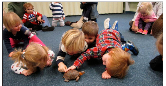
The easiest way to pet a turtle is obviously to get down to its level!