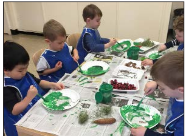
Christmas wreath construction in room 19.