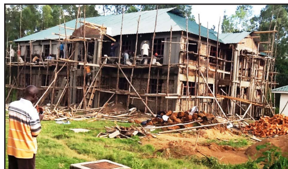
NPC gave a special Foundations for the Future Mission Grant to build this much needed dormitory.