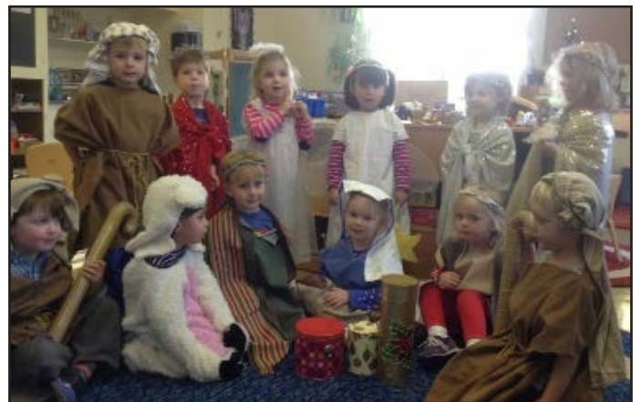
Nativity Story Dress-up