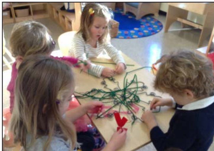
Wreath making in room 15.