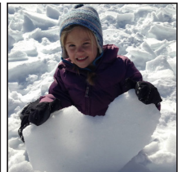
Bailey building a sculpture out of ice.