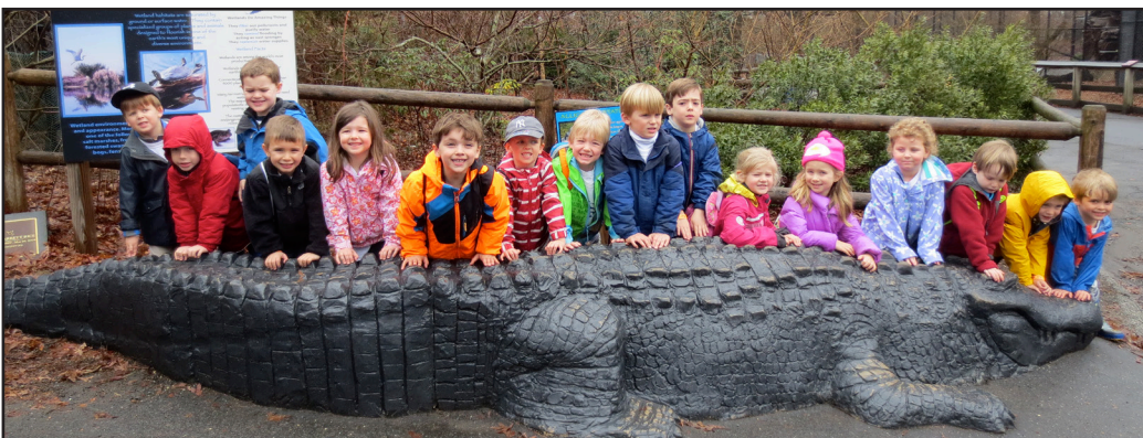
The Pre-K class had a fun day at the Beardsley Zoo.