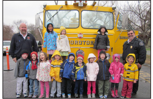
Room 10 fours loved climbing on the fire truck.