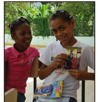
World Vision, Palmera ADP, Dominican Republic