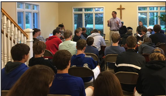
Fellowship of Christian Athletes, Darien