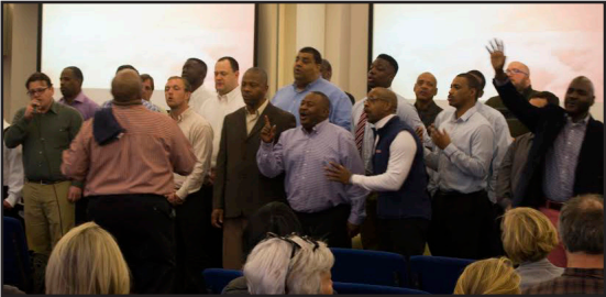
Pivot Ministries, Bridgeport