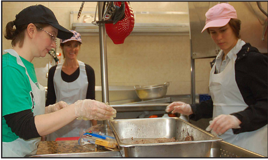
Open Door Shelter, Norwalk