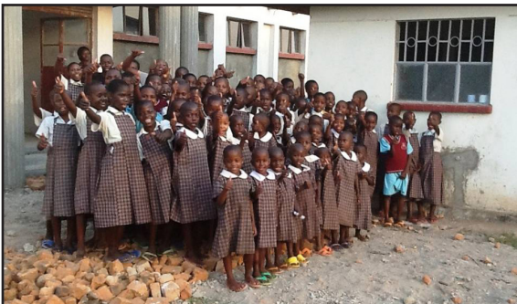
Nambale Magnet School, Kenya