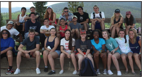
Young Life, Darien