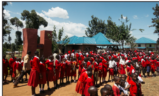
Teamwork Ministries, City of Hope, Tanzania