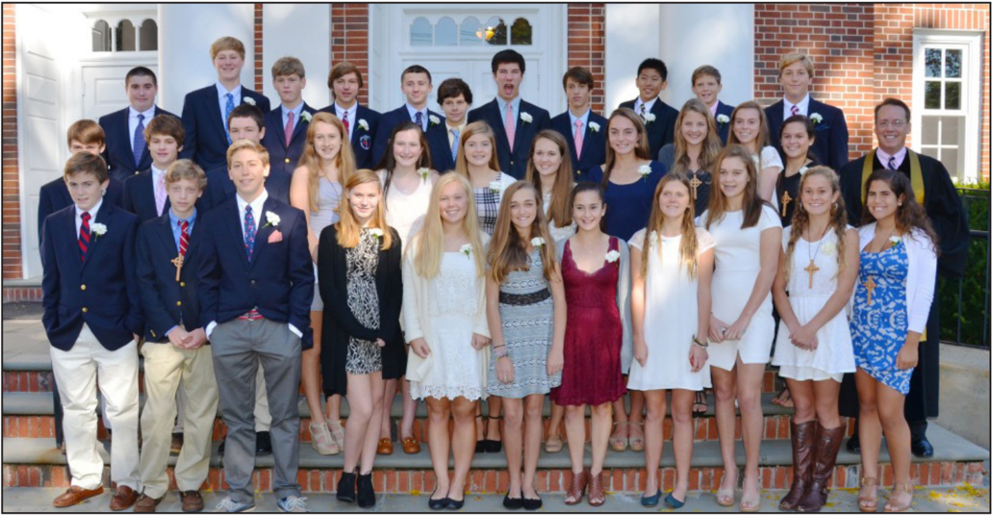
2014 Confirmation Class