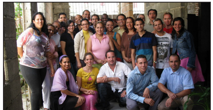
Students at the Evangelical Theological Seminary in Matanzas, Cuba