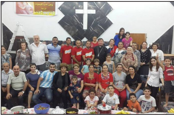
Displaced families that have moved into the Presbyterian Church in Kirkuk, Iraq