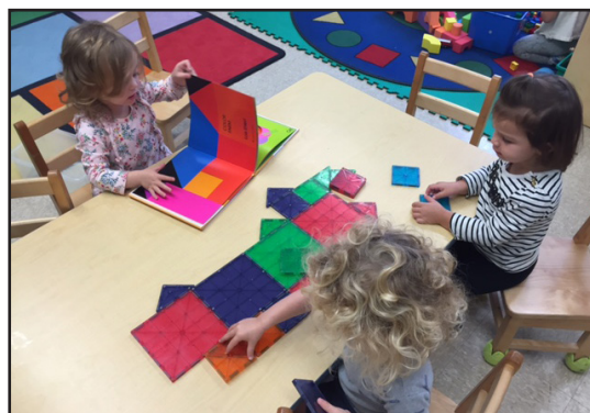
Together, using the Magna-Tiles, the children build a one-dimension barn.