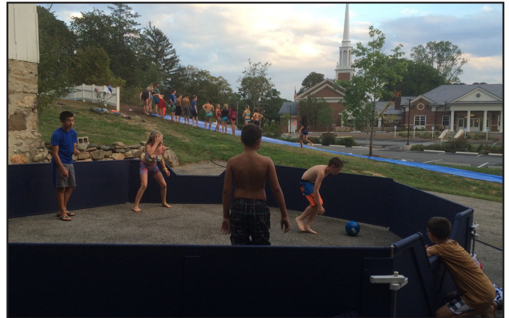
Middle School Late Nighter

As Thanksgiving approaches, Middle Schoolers are invited to join us for our Harbor Thanksgiving Special, which will take place on Wednesday, November 23 , from 12:30-1:30pm at the SHAC. Fun thanksgiving themed activities are being planned as we kick-off the holiday weekend together!