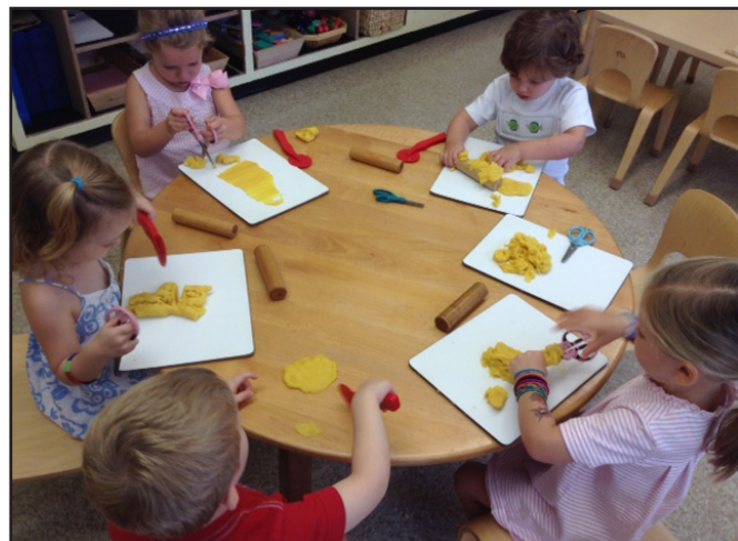
Play-dough fun in room 15