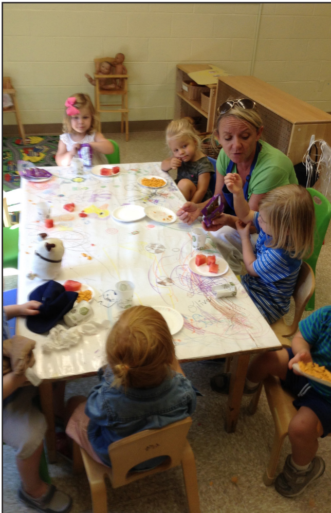
Snack time in the 2's