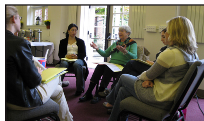
Volunteers facilitate small group discussions

If you are making a commitment to a faith and a church family, it's important to know the values and principles of the fellowship you are joining!