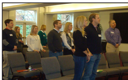
New members singing praises

A person's commitment to one church is made official through membership. A faithful member accepts Christ's call to be involved responsibly in his church – to join hearts together in ministry and hands in service.