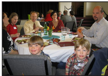
Enjoying fellowship and making connections

"We very much enjoyed our new member class and feel it was a great introduction to the church. I think it was an invaluable experience."