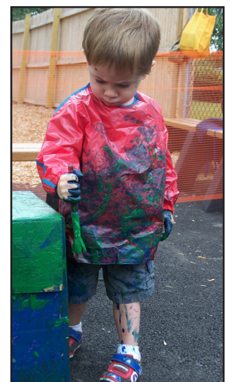
Outdoor art day - Mom, aren't you glad I wore a smock?