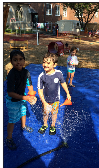
Water day - chillin' under the sprinkler