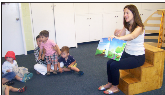
Storytime visit from Darien library